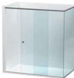
FRONT & RETURN